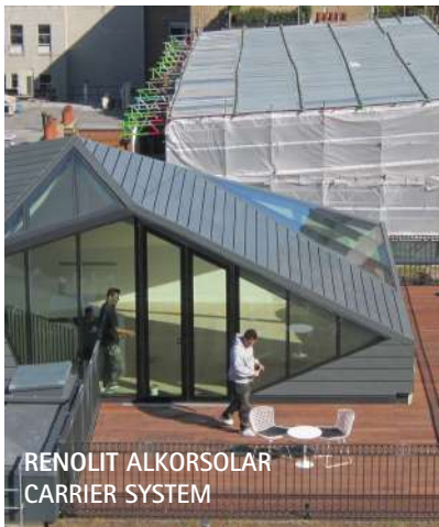
RENOLIT ALKORSOLAR CARRIER SYSTEM